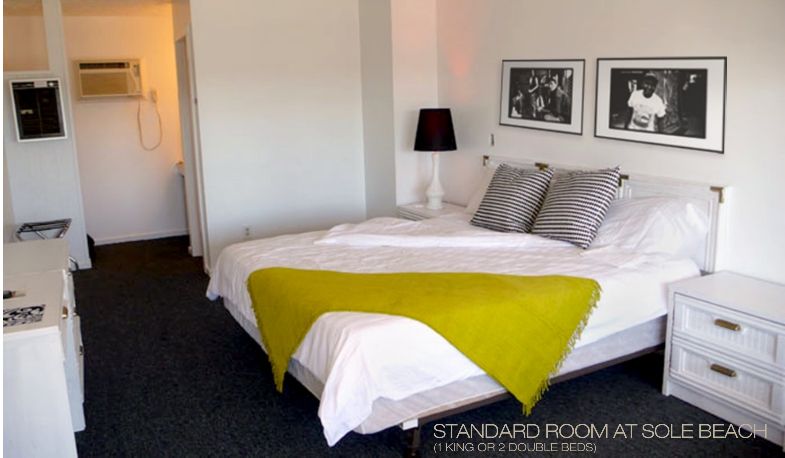
STANDARD ROOM AT SOLE BEACH (1 KING OR 2 DOUBLE BEDS)